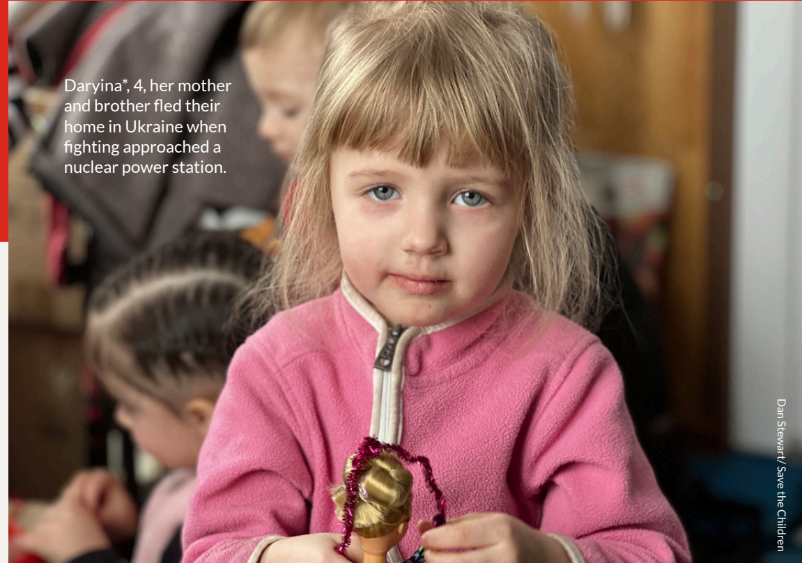
Daryina*, 4, her mother and brother fled their home in Ukraine when fighting approached a nuclear power station.